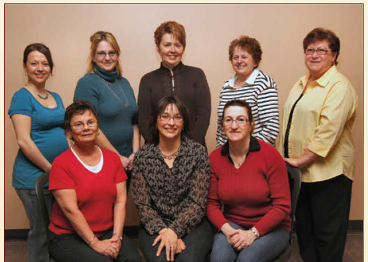
Members of the committee

violence against girls and women in their community. For years, this organization has worked to increase the level of awareness and knowledge with regard to dating violence and existing community resources for helping young girls and women. Some of their activities include: support group for women who are victims of violence, prevention program for teenage girls, development and maintenance of crisis intervention services and the launch of a silent witness silhouette.