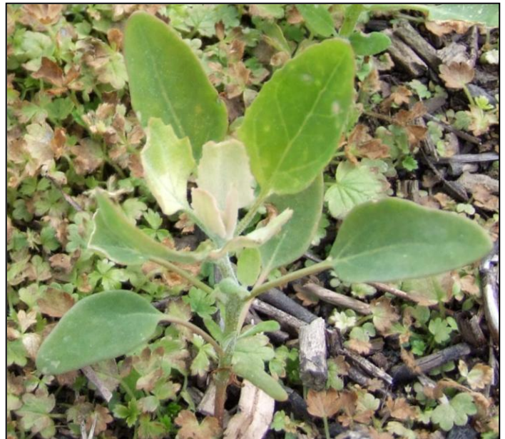
Figure 1. Bleaching symptom on lamb's quarters and rough cinquefoil caused by Callisto.

The active ingredient in Callisto, mesotrione, is a Group 27 herbicide. Callisto has both pre-emergent (soil) and post-emergent (leaf) activity. This type of herbicide inhibits an enzyme, p-hydroxyphenyl pyruvate dioxygenase (HPPD) which is involved in pigment synthesis. In susceptible plants, herbicide activity results in bleaching symptoms, followed by plant death (Figure 1). Bleaching typically begins in leaf foliage and at growing points, 3-5 days after application, with weed death 2-3 weeks later. The bleaching symptom may be noted on less susceptible plants (like sheep sorrel in blueberry production) but may not result in plant death.