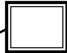
Button Ad 180 x 150 pixels