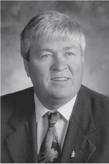
Hon. Dale Graham

Dale Allison Graham was elected to the Legislative Assembly of New Brunswick as the Progressive Conservative Party Member for Carleton North in a by-election held June 28, 1993. After redistribution, he was re-elected in the general election held September 11, 1995, to represent the new riding of Carleton.