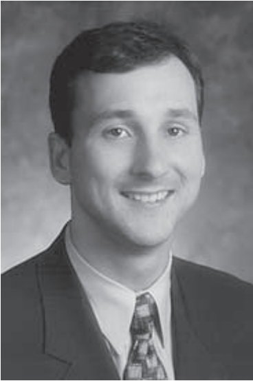
Hon. Bernard Lord

As New Brunswick's 30th Premier, Bernard Lord's vision of New Brunswick is one of a prosperous province with Greater Opportunity for people achieved by changing the way government works for New Brunswickers. This vision embraces who we are as a province, builds on our strengths, and allows New Brunswick to reach its full potential as a competitive, compassionate province.