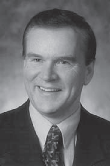
Hon. Percy Mockler

Percy Paul Mockler was born in St. Leonard, N.B., April 14, 1949. He was educated in the public school system of St. Leonard and obtained Bachelor of Arts in Political Science and Sociology and Master of Business Administration degrees from the Université de Moncton.